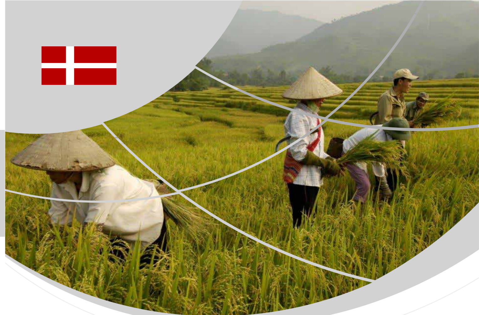
► Support to agriculture and rural development in mountainous areas of Vietnam